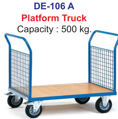
DE-106 A Platform Truck Capacity : 500 kg.