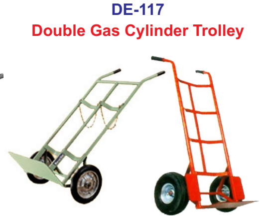
DE-117 Double Gas Cylinder Trolley