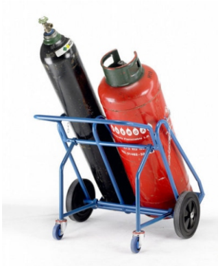
DE-110 A Drum Trolley (4 Wheeler)