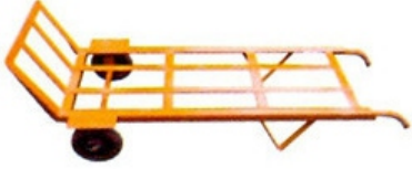
DE-104 Platform Truck Capacity : 500 kg. to 2000 kg.