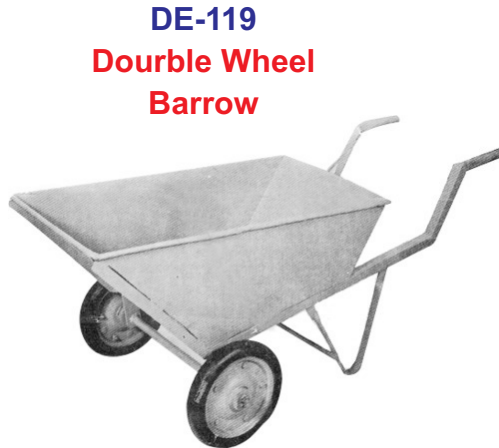
DE-119 Double Wheel Barrow