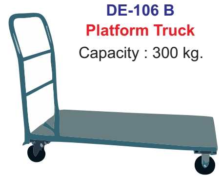
DE-106 B Platform Truck Capacity : 300 kg.